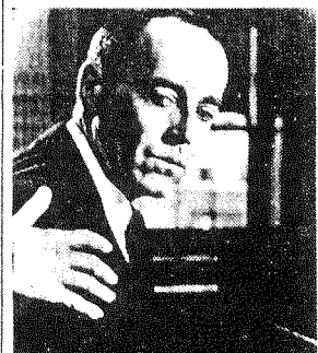
Manie (Henry Fonda) in agnony

It is due to the talent of Hitchcock that we never get tired of the film which lasts more than two hours.