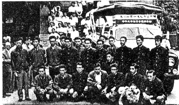
26 Auto-Club members are seen posed before their departure from the main gate on June 22. They will return to Tokyo on 12th this month.

The auto-club's trip this time has five-fold purposes; "to learn and obtain the technique of long-distance driving," "to develop the spirit of endurance and co-operation," "to investigate road and traffic conditions.